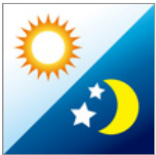
day / night function