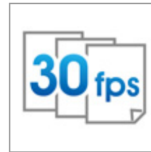
30fps frame rate