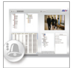
instant DVR alarm playback