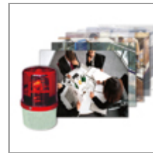
live alarm notifications