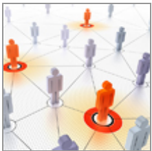
management of 16 DVRs/NVRs