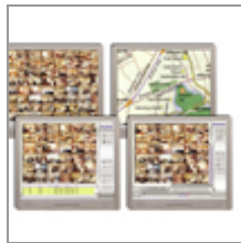
supports 4-monitor output